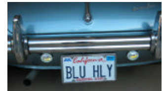
55 watt halogen mini driving lights installed as backup lights.

family and see Glacier National Park. Reservations that far have been made. Open Roads 2004 in Lake Tahoe helped determine the timing for this trip.