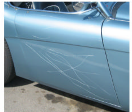
11 slashes, Why??