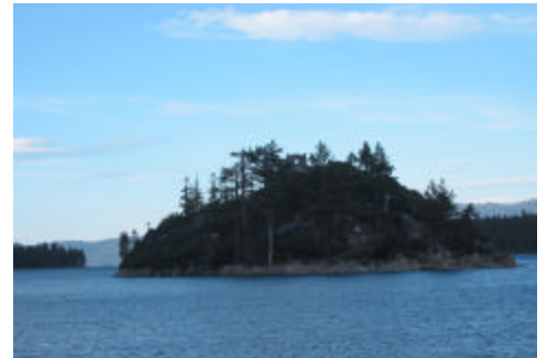
"Tea House" on Fannette Island in Emerald Bay.

usual he fastened on the cockpit cover, then the car cover, slipping elastics over the wheel spinners to prevent wind disturbance. At 5:30 PM we congregated in the lobby for the shuttle bus to the Tahoe Queen for a dinner cruise to Emerald Bay and around Fannette Island, the only island in Lake Tahoe. Ronni reserved us a nice table. In spite of the too loud live music we enjoyed the evening with Ronni, Bill, the Baron's, the Phillips, George, Sharon and Wally. Later up on deck we met more members, observing the stern wheeler and scenic lake views as the sun set.