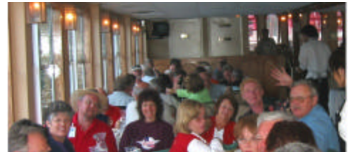
Dinner on board the Tahoe Queen