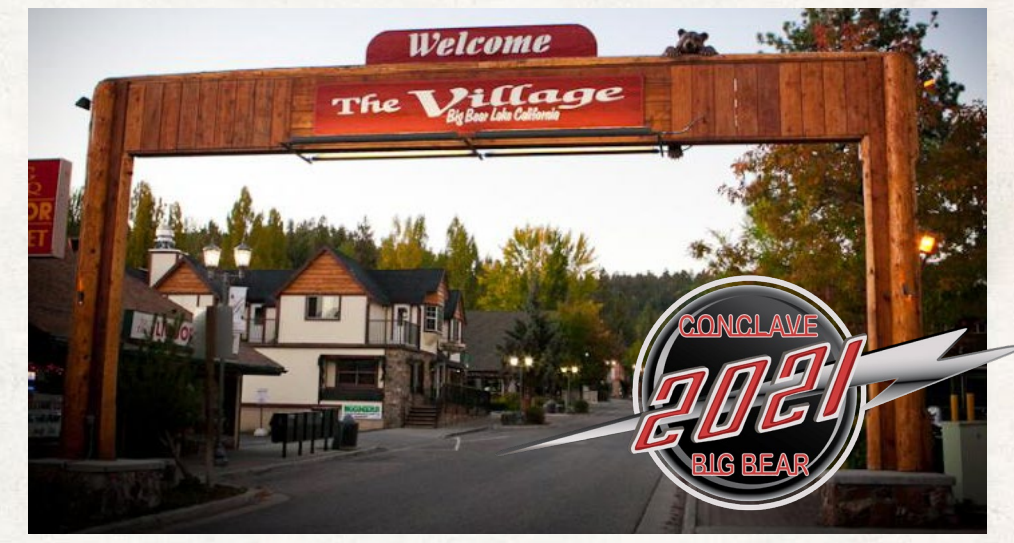
Photo: The Village - a beautiful shopping and entertainment district at Big Bear Lake, CA

Attendees are expected to enjoy the cool mountain air and expansive views across the lake and mountains during several drives including a Poker Run and Scenic Drive and Rally to Joshua Tree National Park. A Gymkhana and Funkhana will be held at Big Bear Airport and the Car Show on the village's Main Street will be a highlight for attendees and locals alike.