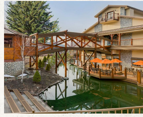
more. The ambiance is "mountain cabin" throughout.

The Lodge at Big Bear Lake (a Holiday Inn Resort) will host Conclave guests and many of the events. Located at 7500 feet elevation in the heart of the San Bernardino National Forest, the resort is only two hours from downtown LA and 80 minutes from Ontario International Airport which boasts some of the lowest fares in SoCal. But don't let that fool you, Big Bear couldn't be further from the congestion and bad air of the LA Basin.